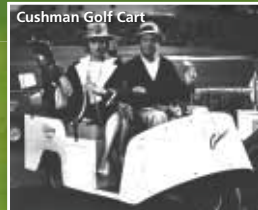
Cushman Golf Cart 1967 - Bob Hope and Lucille Ball enjoy a round of golf using the newly introduced Cushman golf cart.