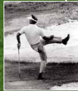
1964 - Arnold Palmer wins his third US Open title and his fourth Masters. He would go on to win his fourth and final Masters Tournament that year.