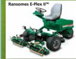
Ransomes E-Plex II™ 1998 - Jacobsen buys Ransomes, a British company with a two-hundred year history manufacturing agriculture and turf maintenance tractors, mowers and accessories. Ransomes brings many new products and brands under the Jacobsen name, including Cushman trucks and Ryan aerators. Included in the Ransomes product line is the all-electric E-Plex II™.