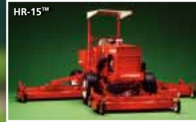
HR-15™ 1984 - The HR-15™, HR-5™ and the C-4VA Butler tractor added to the product line. The HR-15 was the first large-area rotary mower. Designed as an efficient way to cut grass at parks, schools and other municipal areas, the HR-15 immediately gained wide acceptance and even cut turf at the White House.