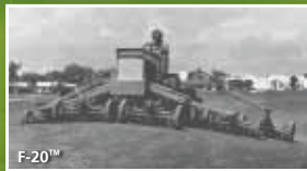
F-20™ 1971 - The F-20™, F-133™ and GT™ series introduced. The F-20 is the world's largest golf course mower at the time - a 78 horsepower tractor pulling nine cutting units, cutting a 19.7 foot swath, capable of mowing 12.55 acres per hour.