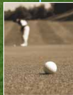
1927 - The USDA announces it has developed creeping bentgrass, which it labels "the perfect putting green grass."

1920 1925 1930 1935 1940 1945 1950 1955 1960 1965 1970 1975 1980 1985 1990 1995 2000 2005 2007