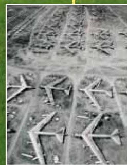
1945 - Many superintendents help the war effort by growing turfgrass for military landing strips and other large areas.