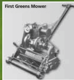
First Greens Mower 1923 - Jacobsen again makes history by introducing the first cast aluminum greens mower to cut fine turf and bent grass greens without damaging the meticulously conditioned surfaces.