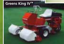
Greens King IV™ 1980 - The legendary triplex mower gets an update, adding a variable-speed foot control, pedal, bigger tires, nine-blade reeds and an industry first - "power backlapping." The Greens King IV™ and one man can still "give a smooth, beautiful cut to 18 average greens in less than four hours."