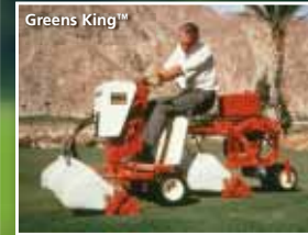
Greens King™ 1968 - Jacobsen leads the way by producing the first riding greens mower - the Greens King™. The mower becomes the standard of the turf maintenance industry.