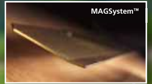
MAGSystem™ 2004 - The revolutionary MAGSystem™ introduced. The breakthrough technology uses magnets to secure bedknives to the rotary wheel - saving time and providing a better quality cut. The MAGSystem becomes the backbone of future technological innovations at Jacobsen.