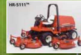
HR-5111™ 1991 - The HR-5111™ and SF-5111™ introduced to the field. One of the first intermediate rotary mowers between 6-16', the HR-5111 could cut an 11' swath - the perfect rotary mower for mid-range cutting.