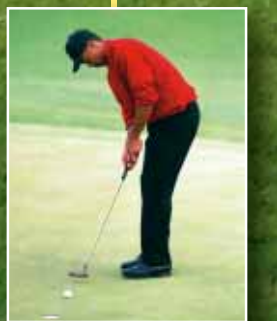
1997 - Tiger Woods puts to win his first major championship, The Masters, by an amazing 12 strokes - the widest margin of victory the tournament has ever seen.