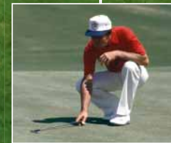
1978 - Gary Player lines up a putt for what would be his proudest victory. At age 42, he birdied seven of the final 10 holes to shoot 64 and win the Masters by a stroke.