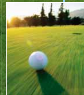
1978 - The USGA introduces the current version of the Stimpmeter. Edward Simpson, Sr. originally invented the green speed measuring device in 1936.