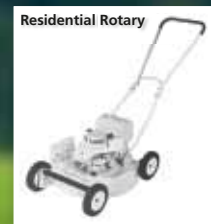
Residential Rotary 1955 - Jacobsen unveils another major breakthrough with the introduction of the first rotary mower for home use that uses four reversible rotary cutting blades. This provides finer cutting of grass and a reduction in clipping clogs. Recognition of Jacobsen quality came with the selection of Jacobsen mowers for maintenance of the grounds at the 1958 Brussels World's Fair.