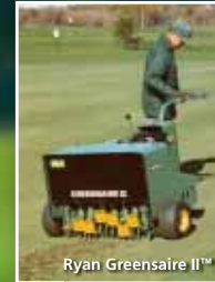
Ryan Greensaire II™ 1975 - The second generation Ryan aerator became very popular on golf courses. The self-propelled machine could remove 180,000 cores from a 5,000 square-foot green.