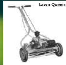
Lawn Queen 1939 - Jacobsen introduces one of the industry's first power mowers for the average-sized lawn called the Lawn Queen. Initial positive interest for the product was interrupted by the outbreak of WWII.