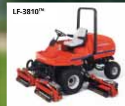
LF-3810™ 1992 - The LF-3810™ midweight fairway unit and the Greens King 422™, an updated version of the walking greens mower, are introduced.