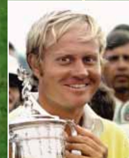
1972 - Among his many other victories that year, Jack Nicklaus wins his third US Open title and his fourth Masters. He is the leading money winner and voted PGA Player of the Year for the fifth time.