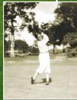
1930 - Bobby Jones wins the Southeastern Open. He would go on to win the Grand Slam that year and cement his legacy as the greatest amateur golfer in history.