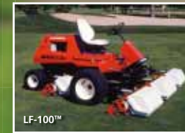
LF-100™ 1989 - The LF-100™ is introduced. An industry first, the lightweight 5-gang mower was specifically designed from the ground up to be as light as possible, providing less compaction and healthier turf.