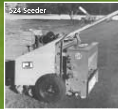
524 Seeder 1960 - Jacobsen acquires Rogers Manufacturing Company of Olathe, KS and Sol Master of Minneapolis, MN, expanding the Jacobsen line of commercial turf maintenance products.