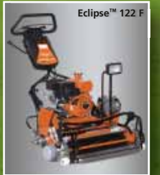
Eclipse™ 122 F 2007 - In 2007, Jacobsen releases the world's first hybrid walking greens mower - the Eclipse™ 122 F. The mower offers unprecedented adaptability and control.

1920 1925 1930 1935 1940 1945 1950 1955 1960 1965 1970 1975 1980 1985 1990 1995 2000 2005 2007